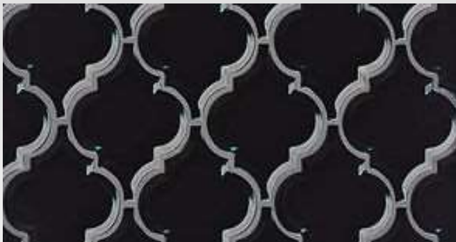
Provincetown Fleet Black