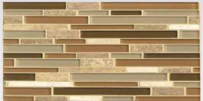
Tiffany Glass Jade